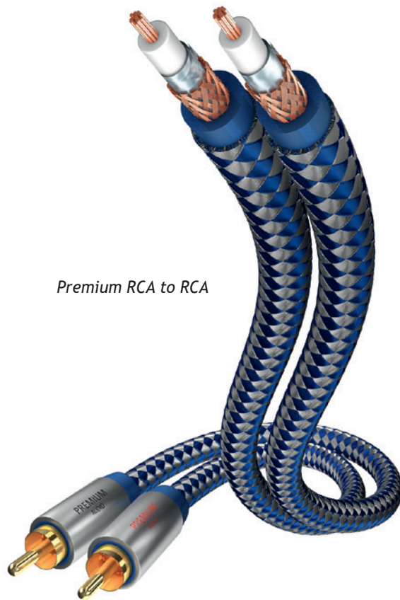
Premium RCA to RCA

performance these In-Akustik cables achieve in practice. I started off by running the minijack-to-RCA cable between an Audioquest Dragonfly Red DAC plugged into my MacBook Pro, and the RCA stereo analogue input of an ADL Esprit headphone amp.